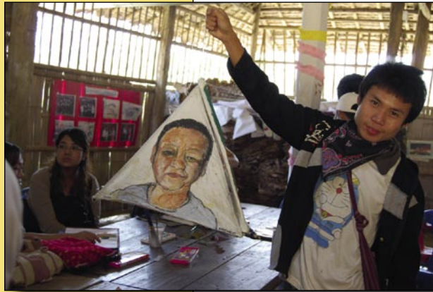
Above: Young refugee students at AKF sponsored arts workshop.